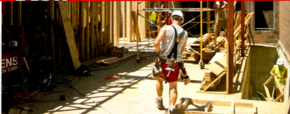
Stevens Construction Corp. crews install a new steel structure inside the façade of an 85-year-old building at 408 W. Gorham St., Madison. The building will soon be home to the Brickhouse BBQ.