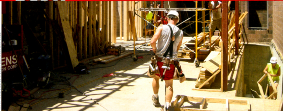
Stevens Construction Corp. crews install a new steel structure inside the façade of an 85-year-old building at 408 W. Gorham St., Madison. The building will soon be home to the Brickhouse BBQ.